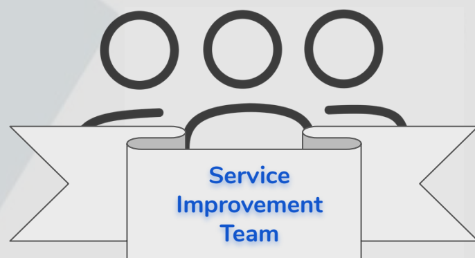
2019 participating services

We're assisting services to complete a Service Improvement Plan to address local issues